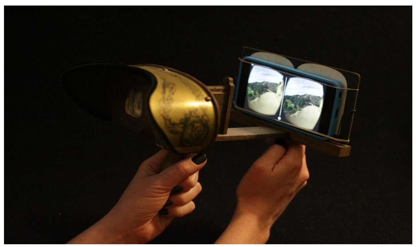
Early research & design with smartphone and stereoscope.