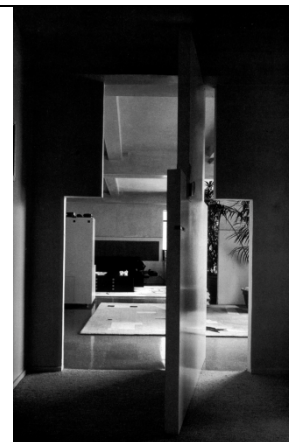
The Cohen Apartments; by architect Steven Holl. The plans and interiors of such buildings, even