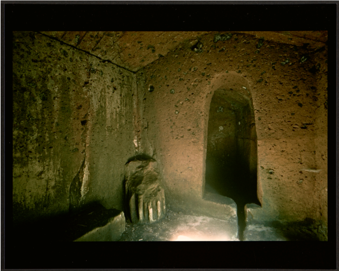
Inside a tomb at Cerveteri, Italy