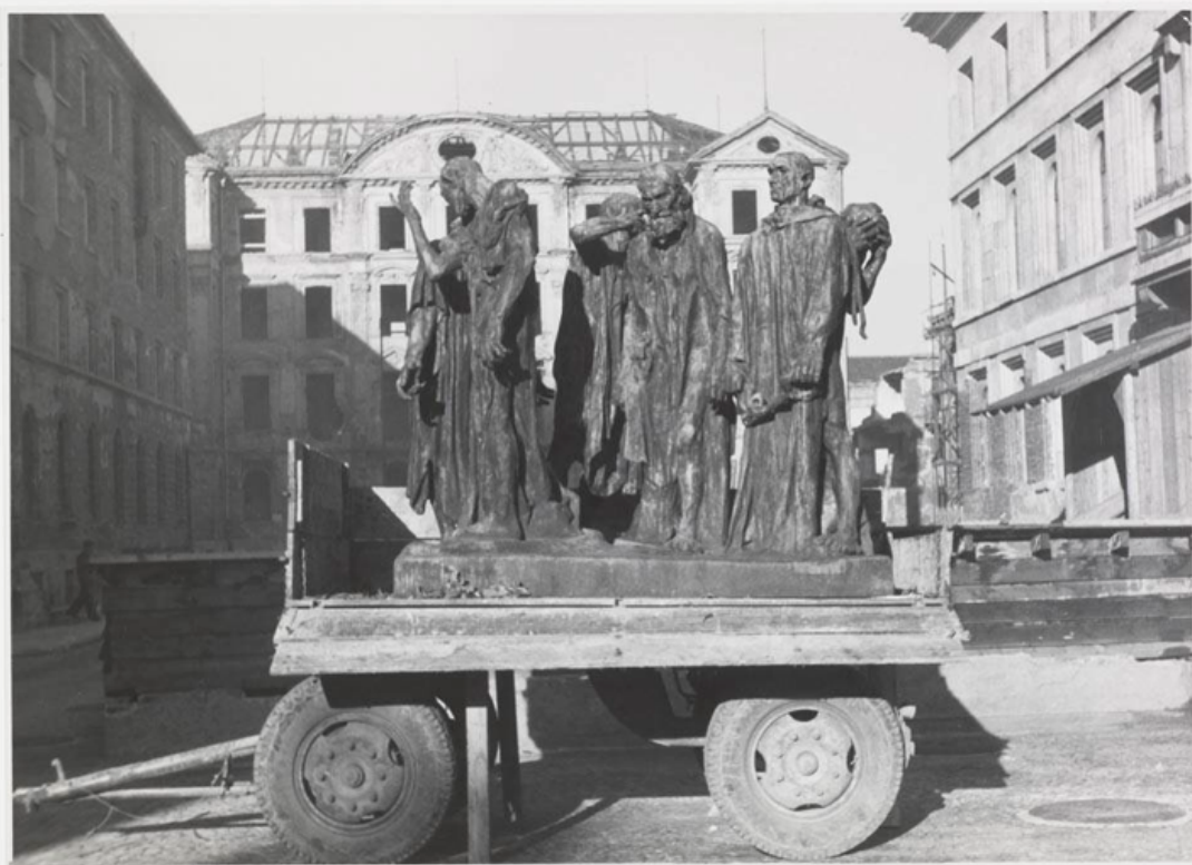
Auguste Rodin’s Burghers of Calais recovered from a forest at the Central Collecting Point, Munich. (89.P.4)

After World War II, Felbermeyer was working in Germany as the chief photographer at the Allied Forces’ Monuments, Fine Arts, and Archives section’s Central Collecting Point in Munich, where over one million artworks that had been confiscated by the Third Reich were inventoried, photographed, and ultimately repatriated. The GRI holds about 700 of Felbermeyer’s photographs from the MCCA documenting the people involved and about 500 photographs of European paintings and sculptures of known and unknown provenance. 3