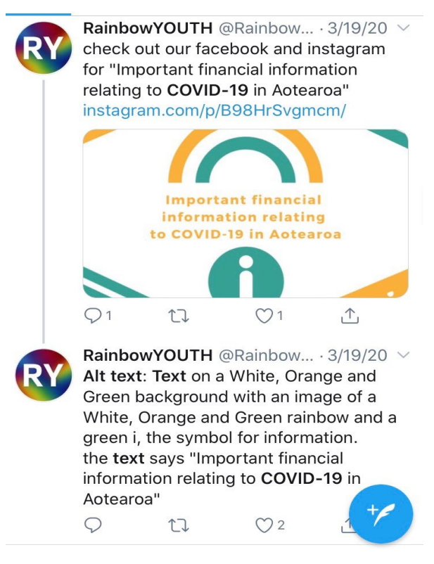
Figure 1: Example of Alt Text on Twitter (@)RainbowYOUTH, March 19, 2020).

Figure 1 is an example of an organization making an image accessible on Twitter via alt-text. There are two tweets: the first tweet is a non-screen readable image followed by a tweet with the alt