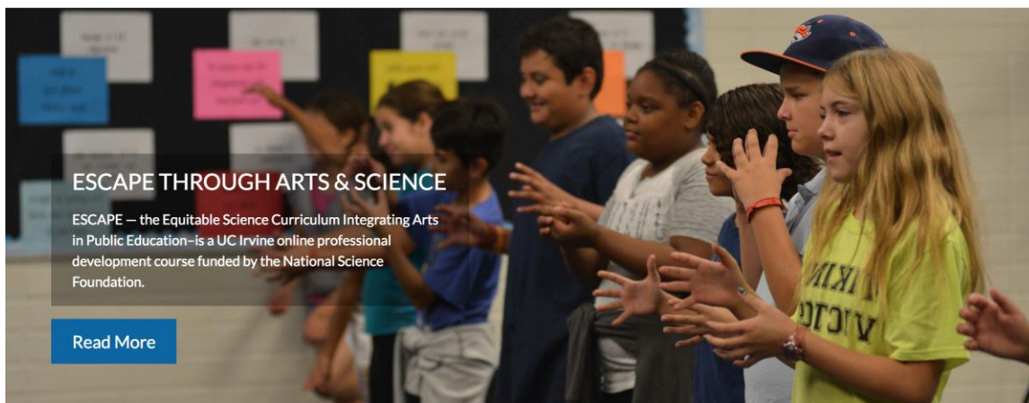
Figure 5 – ESCAPE Project Landing Page