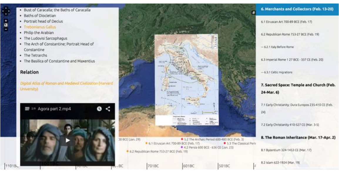
Figure 1: Screenshot of the interactive Neatline syllabus for Introduction to Art History.

Neatline's multifaceted interface supports this kind of multidimensional, synchronous narrative by highlighting the shared spaces and times in which raw materials gained cultural significance, objects were shaped from these materials, and cultural exchange occurred through the transmission of objects. The syllabus interface (Fig. 1) is divided into four sections: map, timeline, outline, and information window. Units and lectures are listed in an outline (at right), that resembles an outline found in a white paper syllabus. Clicking on a unit or lecture reveals a popup window (at left) with specific information about that item, including topics, regions, and time periods covered; class meeting dates and homework assignments; links to significant objects' museum webpages; lecture slides; georeferenced map layers; and relevant videos and images. Units and lectures are connected to specific points on the timeline (at bottom) and to points, polygons, and/or map layers shown on the satellite view (at center). Units are color-coded on the timeline to highlight the simultaneity or distance of the different civilizations; the temporal movement of the lectures backwards and forwards in time as it jumps spatially from place to place.