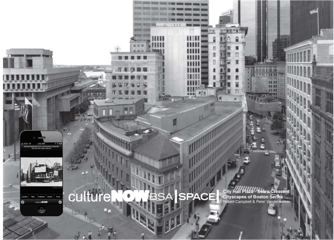
Figure 7 - Cityscapes of Boston<sup>10</sup>

We have also included many temporary works on the site. There are many art exhibitions that last for a few weeks. Currently, for instance, we are partnering with Compassionate St. Augustine to exhibit a series of obelisks that they have commissioned for public spaces in their downtown. The artists have made podcasts and we set up a self -guided tour. We've collaborated with other cities to promote temporary art festivals, such as Pasadena, New Orleans and Scottsdale.