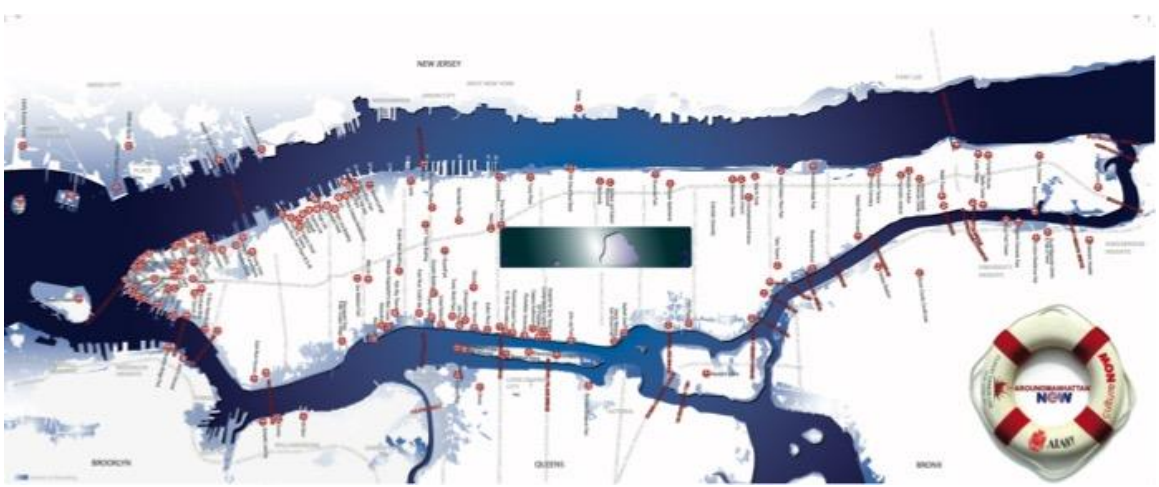
Figure 8 - AroundManhattanNOW Map showing extent of flooding after Sandy

In 2010, we collaborated with MoMA on the Rising Currents show, which imagined what would happen if the waters of Palisades Bay rose between 3 and 6 feet, something anticipated to occur by 2050. Two years later, Superstorm Sandy struck, and no longer did the city have the luxury of time, as at its peak the storm surge deluged lower Manhattan with nearly 13' of water and debris. Our software allows us to create bounded areas, which we had been using to define historic districts and public parks. In moments, we had a list of all the cultural assets that were impacted. It proved incredibly useful for FEMA and for some of the resiliency planning that the Municipal Art Society, AIA, and the City of New York were undertaking.