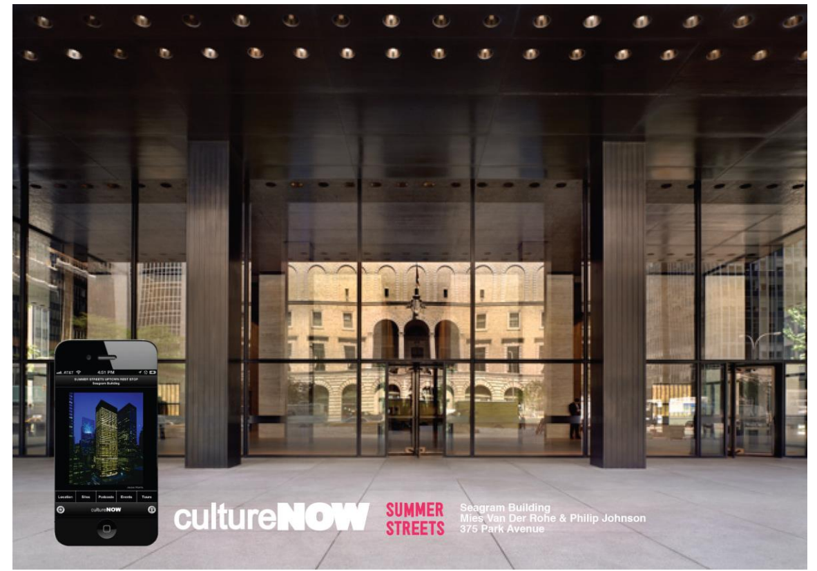
Figure 4 - Summer Streets Seagram Building<sup>5</sup>