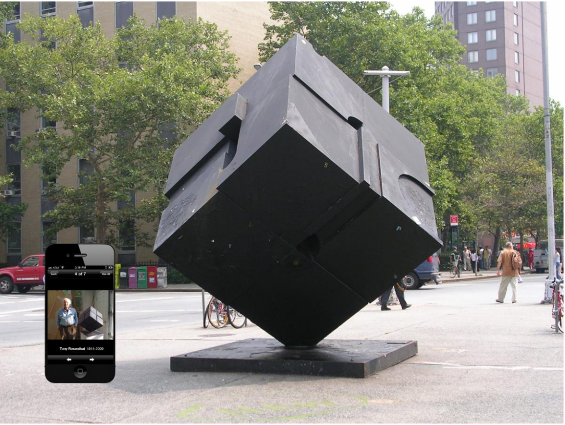
Figure 5 - Alamo with Tony Rosenthal <sup>8</sup>

another job. cultureNOW, though, provides access to this collection; our site includes its walking tours, which have remained part of cultureNOW's website/app.<sup>7</sup>