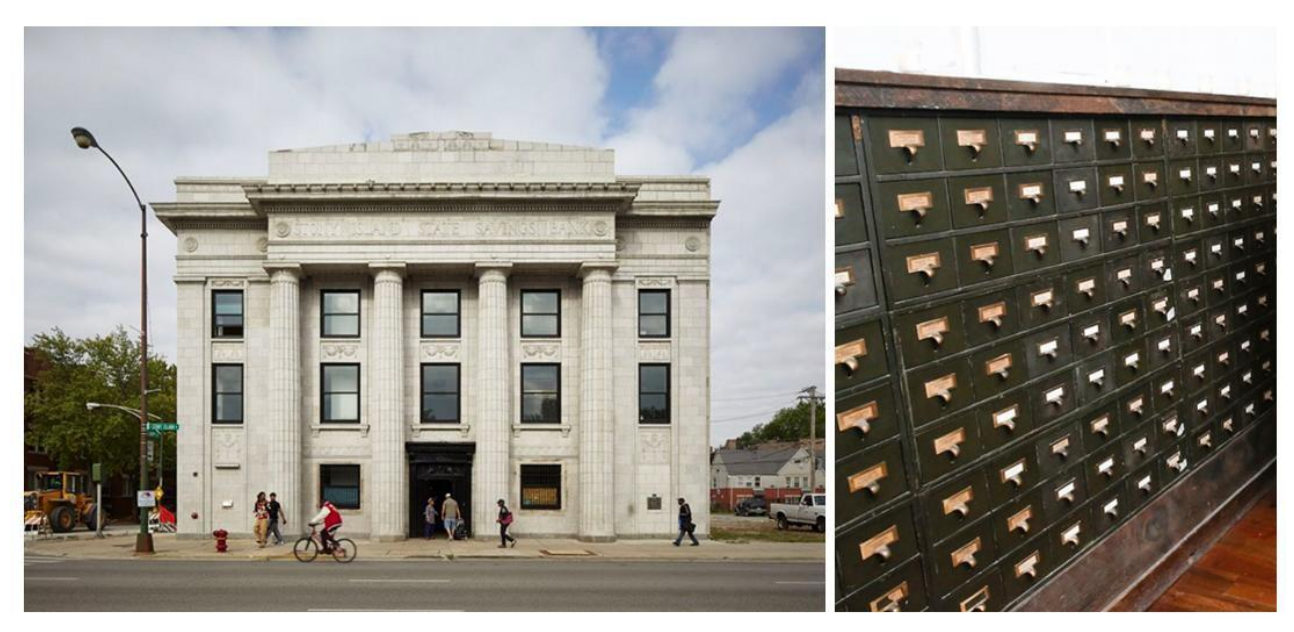
Figure 5. Stony Island Arts Bank, Tom Harris © Hedrich Blessing. Courtesy of Rebuild Foundation