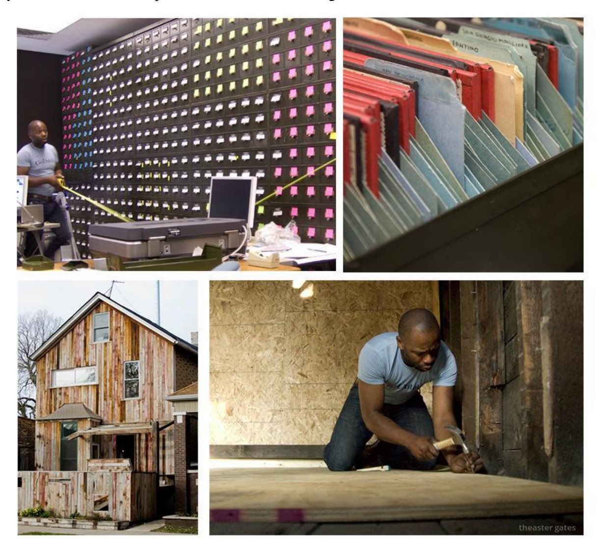
Figure 1. Coordinating the move of the lantern slides.

The slide transfer was not as easy as initially planned. After measuring the cabinets carefully as well as the space where they would be housed on Dorchester Avenue, the movers were scheduled to assess the project. They determined that the Dorchester building was not structurally sound and Gates would have to heavily reinforce the floor to bear the 6ton weight of the collection before they could be moved. With the help of an engineer, the foundation was repaired, 4x4" posts were installed in the basement level under the proposed slide room and \frac{3}{4} " plywood was added on top of the deteriorated flooring.