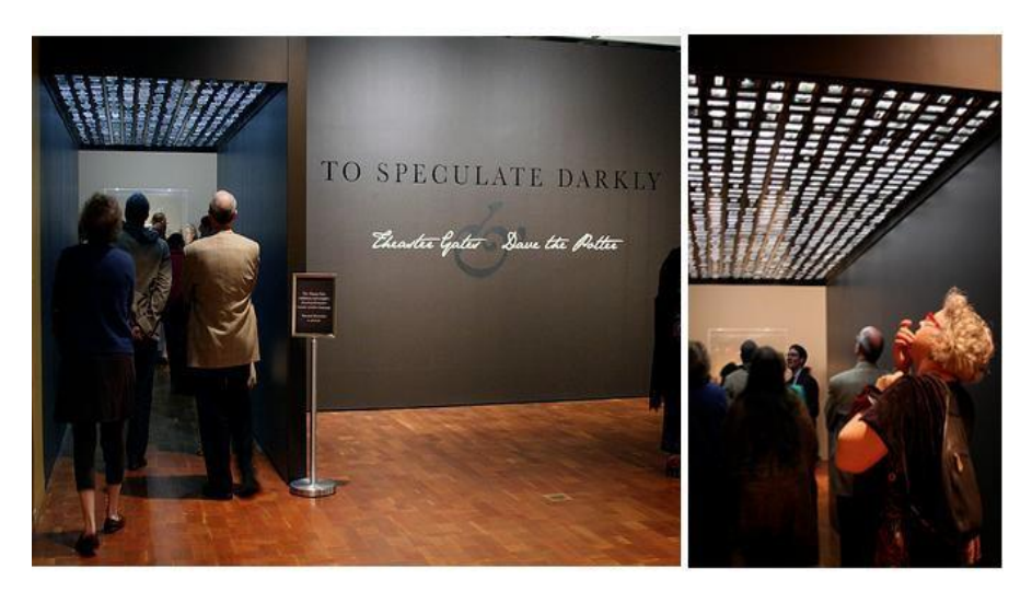
Figure 3. Milwaukee Art Museum exhibition