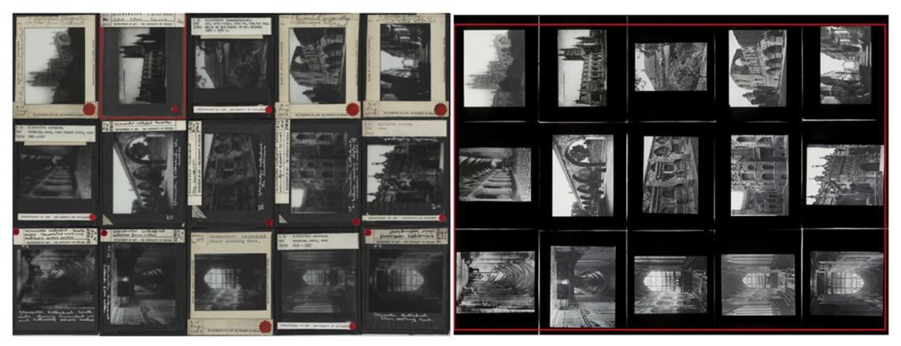
Figure 2. Reflective and transparent full-bed scans

Also in preparation for the move, the VRC called upon faculty to select slides to be digitized, knowing that scanning all 60,000 would be an impossible feat. The majority of slides that were chosen were images of Medieval art and architecture, both because they were often original photography and also seem to have a beautiful richness that other slides lack, especially the black and white reproductions of color two-dimensional work. The VRC then ushered the four thousand selected slides through a rapid scanning project. To conduct the rapid scanning, fifteen lantern slides were laid on an oversize flatbed scanner, and two scans were made; first, a reflective scan to capture the labels for cataloging, and then a transparent scan to capture the actual images. After the scanning and move were complete, the project was put on hold while our own renovation was in progress.