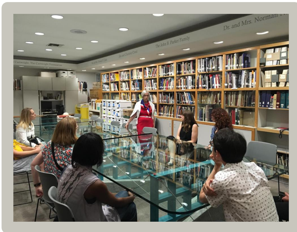
Laguna Art Museum Library

performance of the Pageant of the Masters was a personal “bucket list” item for them, and they appreciated having an opportunity to enjoy the show on a warm summer evening with colleagues old and new.