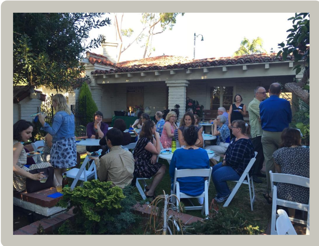
Sherman Library & Gardens Reception