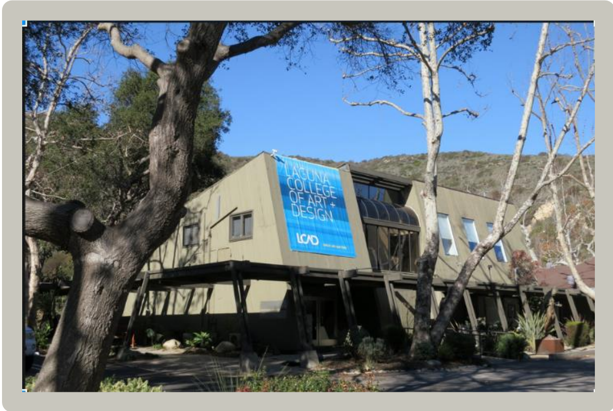
Laguna College of Art + Design

A full day of substantive programming took place on Monday, August 15, at the Laguna College of Art + Design 8 , with twenty presentations for the approximately fifty attendees. The day was structured into morning and afternoon sessions, with lunch followed by a lightning round in the middle. The first session, “Grants, Curation, Digital Projects, and Instruction,” comprised four presentations addressing digital projects from their inception to engagement with users of the materials. The lightning rounds were lively, short presentations covering a wide range of topics, from diverse digital content and grant projects to newer formats and technological tools. The second session, “Description, Metadata, and Preservation” explored systems for managing digital content, clever approaches for obtaining descriptive information, as well as tactics for extending the reach of the materials and ensuring their preservation. For more information about the presentations, search on “Endless Images” in VRA SlideShare http://www.slideshare.net/VisResAssoc and see Appendix A below.