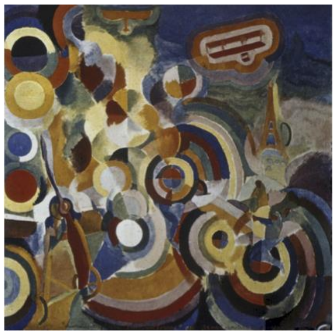
Figure 4: Robert Delaunay, Homage to Bleriot , 1915.

Nonobjective art can be challenging to describe. The Art and Architecture Thesaurus recommends reserving the term "nonobjective" for contemporary art, but in my opinion, that limits the possibility for scholars to make connections between modern abstract art and the art of other times and places. Abstract art is not always as nonobjective as it might appear initially. Practicing subject indexing provides the opportunity to look more carefully at the works we are cataloging. For the image in Figure 4, I first used the terms