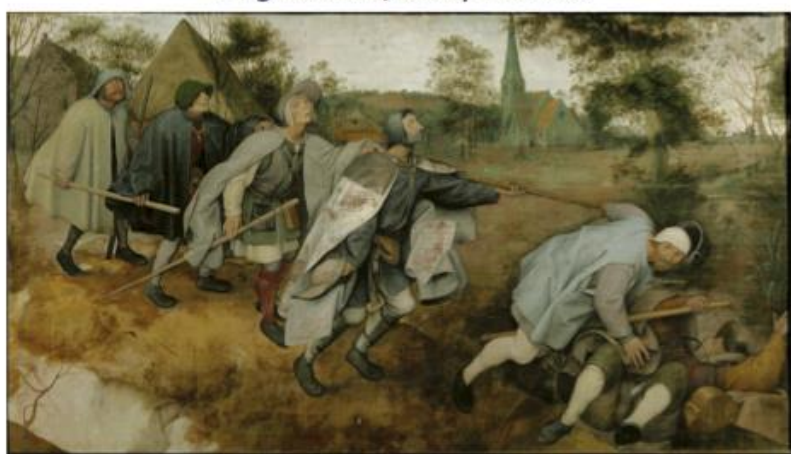
Figure 1. Panofsky's three levels: Pieter Bruegel I, Parable of the Blind Leading the Blind.

Blind Men walking and falling into ditch, church, landscape, rural Christianity, Bible, New Testament, Teaching of Jesus Christ, Parables Dogmatism, inexperience