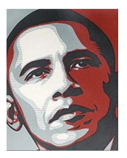
Figure 2. Left: Symbolism. Faith Ringgold's Flag Story Quilt references a national symbol. Right: Visual Metaphor. Shepard Fairey's poster image for the 2008 presidential campaign identifies Barack Obama with the nation by painting his visage in the colors of the flag.