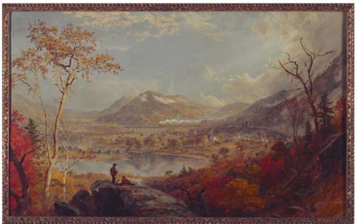
Figure 5. Jasper Cropsey, Starrucca Viaduct, Susquehanna Valley, 1865.

Susquehanna River (link to TGN), autumn leaves, train, transportation, stone arch railroad bridges (AAT), landscape, mountains, panoramas, bodies of water (AAT)