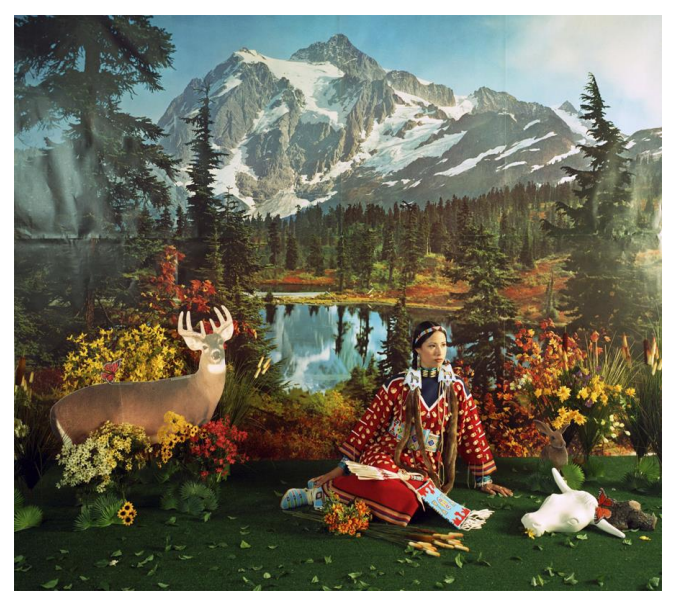
Figure 3. Wendy Red Star, Indian Summer, Four Seasons . 2006.

Similarly, artists use allegory to adorn the human figure with suggestive attributes and settings in order to represent political issues or abstract concepts, such as flower blossoms for spring or autumn colors for fall (Figure 3).