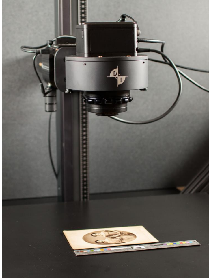
Figure 3 Digital Transitions RCam reprographic camera with Phase One IQ3 100MP digital back