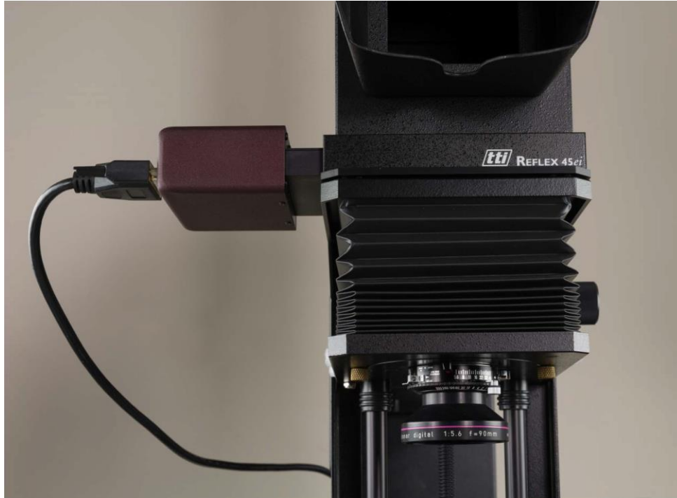
Figure 2 Better Light 6K-HS scan back with TTI 45ei worm drive camera

By late summer we had moved Howard's 40" x 60" TTI copy stand (Figure 1), Better Light scan back (Figure 2) and other equipment to San Anselmo and we began to integrate the Two Cat equipment into our existing workflows. In the fall of 2015, we digitized the letter archive of the Chilean-American writer and Bay Area resident Isabel Allende. Her letters have often served as inspiration for her books, such as her first novel "The House of the Spirits" which was published in 1982 and later made into a movie. We also captured various collections of 35mm slides, and color and black & white large format negatives. Our typical digital capture projects continued, but now we had more options for very large formats and high-resolution capture of 35mm, 4x5 negatives and transparencies. Based on our client's budget and resolution needs, we found ourselves mostly choosing our rapid capture technique using full frame digital SLRs like the Canon 5D Mark II with 50mm or 100mm macro lenses. This works well for many clients. It keeps the cost down and the quality is often sufficient for the client's purposes.