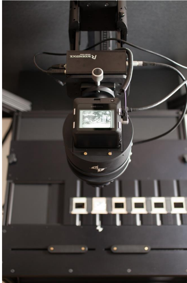
Figure 4 High-throughput capture of 35mm slides with DT RCam and Phase One IQ3 100MP digital back