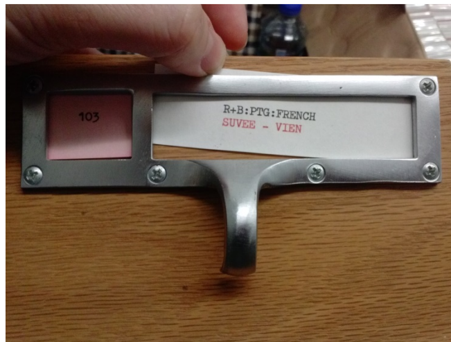
The last drawer is emptied.

My final project was to give away the remaining several thousand photographs and reproductions. I lugged all of them back to my office, and when the new semester began, I sent out an announcement to all undergraduates offering them for free. My office mates and I were astounded by the response we received. I had listed three different times when the photos would be available for taking, but almost everything was gone within the first couple of hours. Our office was packed with students and nearly everything was taken. (In fact, they even took some photographs I had marked as reserved, leaving me to come up with an explanation for a disappointed Classics professor.) I had not suspected that students of today, with their easy access to images anywhere and anytime, would be so fascinated by the prospect of owning old, crumbling, black and white photographs! Certainly the timing must have helped, as students were just moving into their dorm rooms and were looking for wall decorations, but when I found another cache of photos later in the semester, I was met with almost the