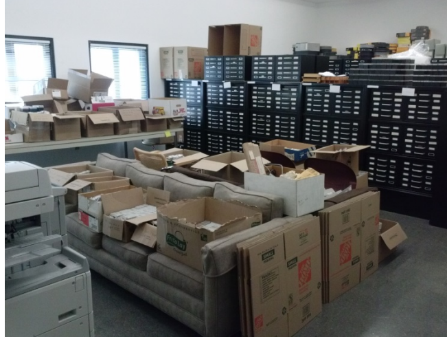
The Slide Library in mid-dissolution.

During the spring semester of 2014, I was given funds to hire three student workers who began the weeding process. In concert with the HIAA chair, I had determined that we would, for the present, keep all original photography of architecture taken by our faculty and others, as well as Chinese painting, medieval manuscripts, Islamic art, and one or two other small subject areas. I wrote up a list of vendors and faculty whose slides we would keep, and a second list of all the general categories of the collection with explanations of how the students should handle each area. Some drawers would be carefully weeded while others would simply be emptied. Anything readily available in digital form from a vendor would be removed. Although it pained me considerably, I decided to discard all Western painting and sculpture without looking at any of it. This was necessary due to time constraints and was made more acceptable to me by the fact that so many of these works are now or would soon be available from other sources, such as ARTstor and museum sites. I know we lost some wonderful material that will never be recovered, but I had to set limits on what we could reasonably do.