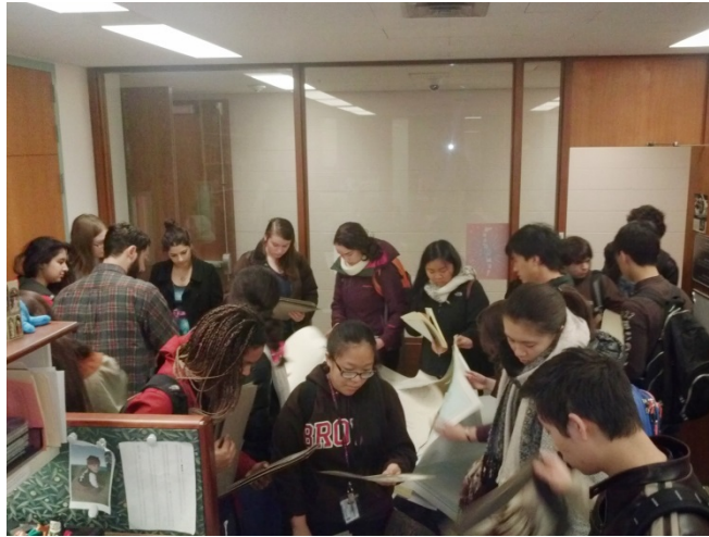
The great undergraduate photo giveaway.

same level of enthusiasm. Clearly the idea of owning something tangible still resonates with the current college generation.