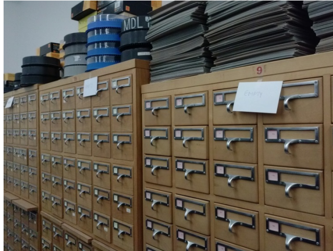
Emptied cabinets topped with mounted photographs awaiting mailing.

As the boxes filled up, I tried to figure out what to do with the slides and photos. I could not bear to throw them into a dumpster. I had visions of the Visual Art faculty creating assignments in all of their classes that involved slides, as a fitting tribute to the lost library, but they exhibited no interest. From time to time, a professor would wander down the hall and utter a variation on, "Oh, this is so sad, but I don't want them." I found my first taker in a Visual Art concentrator who used the slides in his senior thesis exhibition. (I happily did not go to see the exhibition which, I later learned, involved destroying the slides during projection!) My next taker was a colleague of an HIAA professor who asked for thousands of slides to use in installation pieces. I sent out notices to the listservs and websites of the Rhode Island State Council on the Arts, the Massachusetts Cultural Council, the Society of Architectural Historians, ARLIS/NE, and VRA New England.